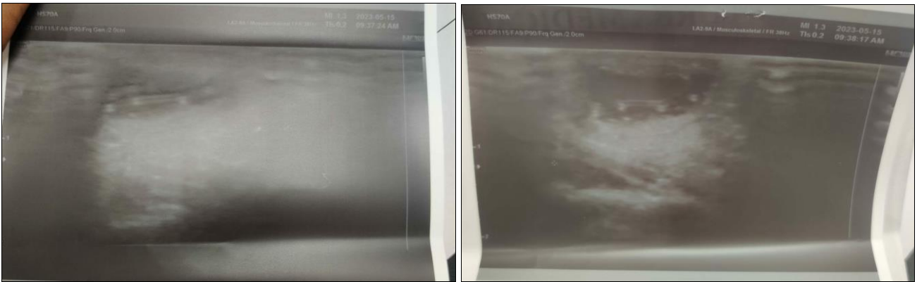
Fig 3-4: Impression was subcutaneous cyst lesion with features likely of parasitic infestation and inflammation

inflammatory changes. Visualised Achilles tendon appears normal.